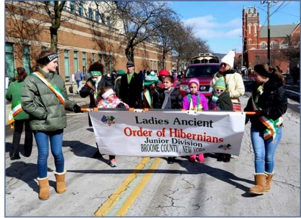
LAOH Junior Division marching in the 50th St. Patrick's Day-parade.