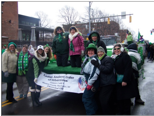
A cold parade day 2017

The parade itself will be a memorable one as well. On March 8 th Rochester and surrounding areas were hit with a tremendous wind storm that packed hurricane force gales of 80 miles per hour with sustained winds of 50-60 miles per hour. As a result 130,000 people were without power for many days (some for up to a week!). Even if people did have power there was damage all over caused by falling trees, limbs and wires. The winds preceded a cold front that had air temperatures in the teens and wind chills in the zero to negative degree range. Many called for the postponement or cancellation of the parade. But the parade committee felt that we were prepared and that the event should go on. And it did.