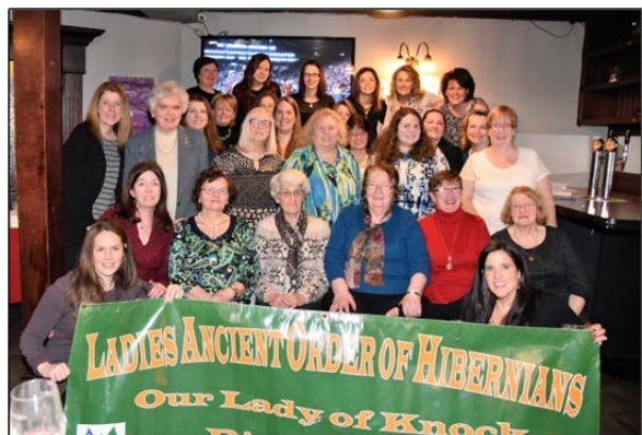
Members of LAOH-Yonkers Division 19 are pictured at their annual St. Brigid's Communion Breakfast on Saturday, February 4th at Burke's Bar & Restaurant on Bronx River Road in Yonkers, NY. A great day was had by all in attendance with