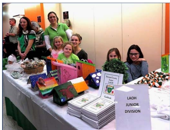
LAOH Juniors craft table at Boscov's Irish Days.

The Broome County LAOH Juniors worked hard building bird cottages, making magnets, and baked goods to sell at Boscov's Irish Days. The Junior LAOH cookbook containing recipes from AOH, LAOH, Junior members as well as family and friends went on sale. The young ladies took turns during the day to volunteer at the table.