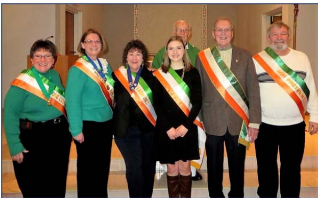
St. Brigid's Mass from left to right BC LAOH President,

The bitter cold and snow did not prevent members of the AOH, LAOH Division 2 and Junior LAOH from joining LAOH Division 1 to celebrate the annual St. Brigid Mass on February 12 th hosted by the Division 1 ladies. Following a beautiful service, members enjoyed lunch at the hall.