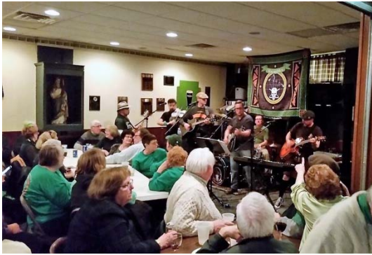
St. Patrick's Day celebration at the AOH Hall with the Shambles.

On St. Patrick's Day, our officers and members attended the flag raisings in Johnson City and Binghamton. Members also attended mass and a party at St. Patrick's Church. Our AOH hall opened its doors to celebrate and enjoyed music by The Shambles in the evening.