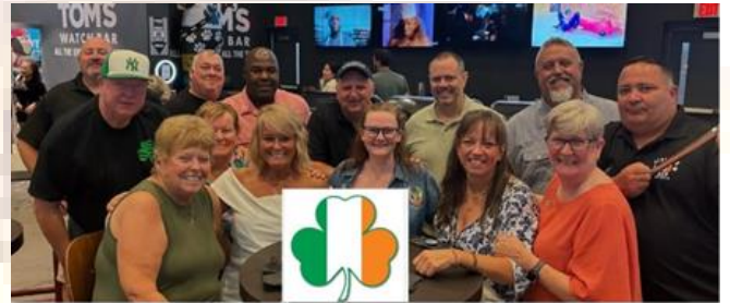
Pictured: Division 7 AOH & LAOH in Florida