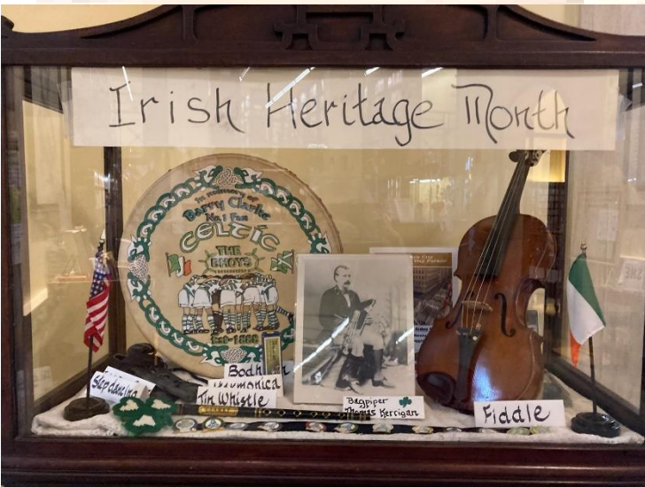
Irish display - Warner Library, Tarrytown, NY