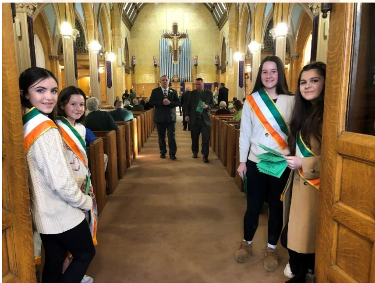
Albany LAOH Junior Members handing out programs at the 2024 St. Patrick's Day Mass

On Saturday, March 16 th , our division stepped out on the avenue for our annual Albany St. Patrick's Day Parade. The day began with a celebratory mass where our Junior members joined us, and ended with a grand celebration at our division hall. A grand time was had by all.