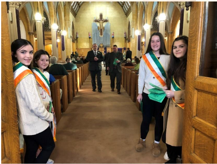
Albany LAOH Junior Members handing out programs at the 2024 St. Patrick's Day Mass

On Saturday, March 16 th , our division stepped out on the avenue for our annual Albany St. Patrick's Day Parade. The day began with a celebratory mass where our Junior members joined us, and ended with a grand celebration at our division hall. A grand time was had by all.