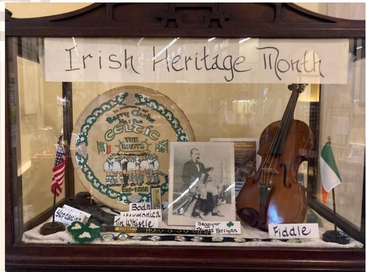
Irish display - Warner Library, Tarrytown, NY