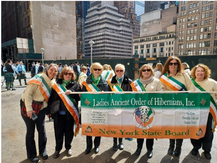
NYS LAOH Board - NYC St. Patrick's Parade