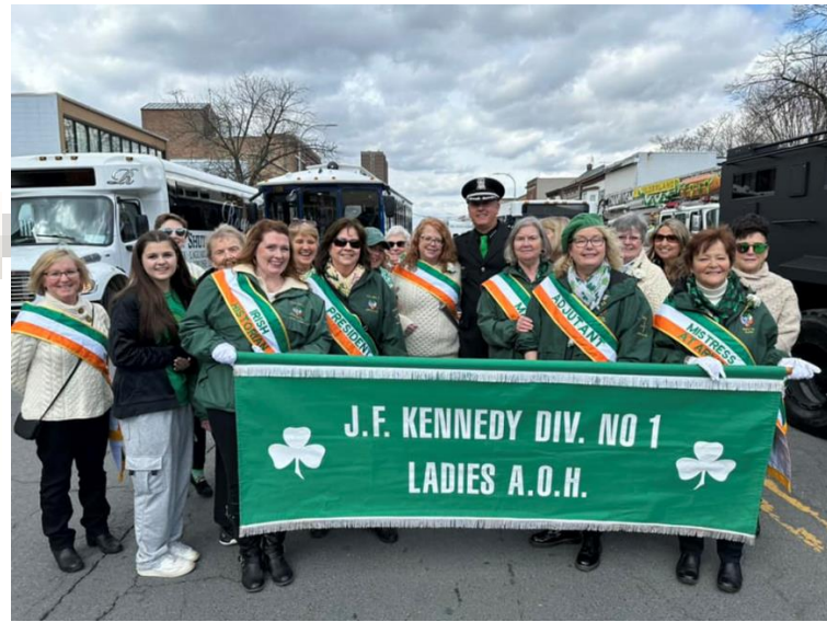
2024 St. Patrick's Day Parade – Albany Ladies with Albany County Sheriff Apple