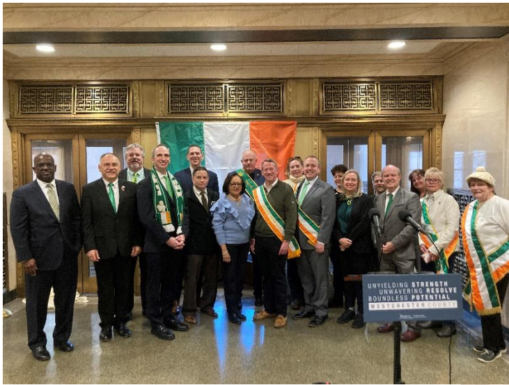
Raising the Irish Flag Westchester County Irish History Month