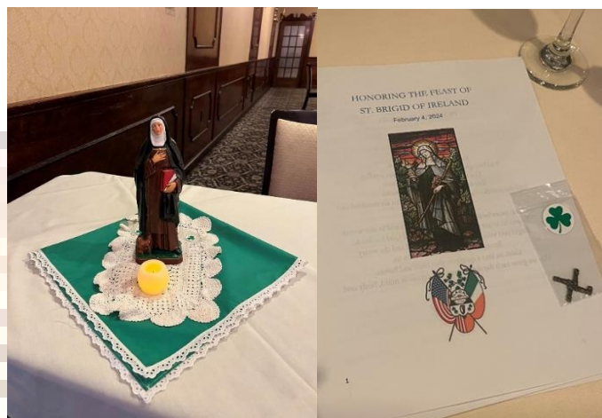
Memorial Statue and Event Program