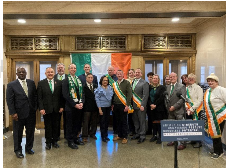
Raising the Irish Flag Westchester County Irish History Month