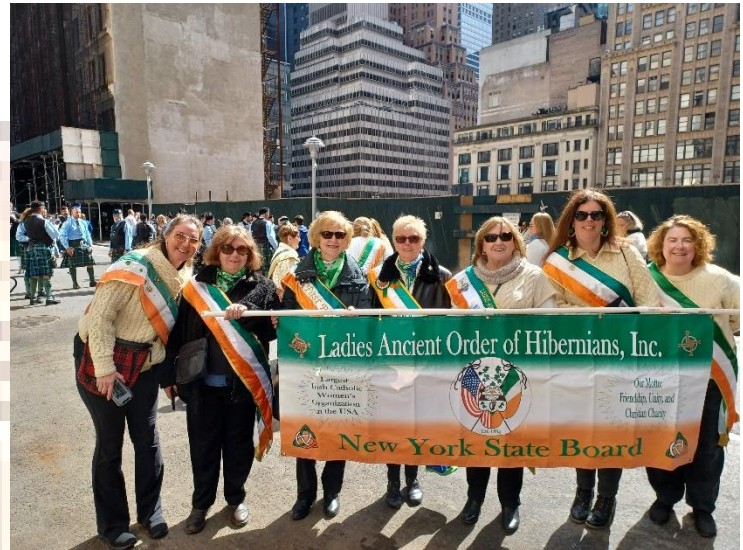
NYS LAOH Board - NYC St. Patrick's Parade