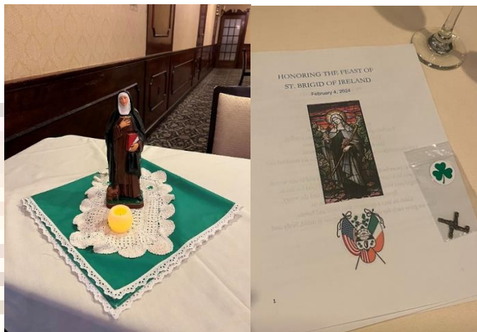
Memorial Statue and Event Program