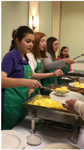
Albany LAOH Division 1 Juniors serving food at the annual AOH Communion Breakfast

hand to help serve breakfast at this annual tradition where we all gather to celebrate our faith together.