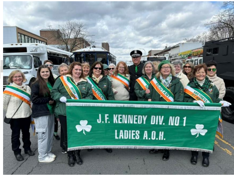
2024 St. Patrick's Day Parade – Albany Ladies with Albany County Sheriff Apple